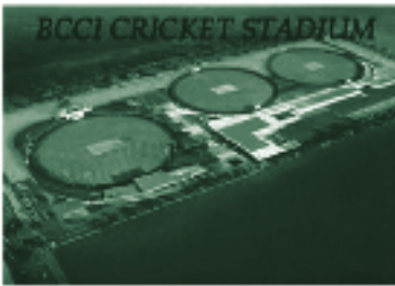
BCCI CRICKET STADIUM