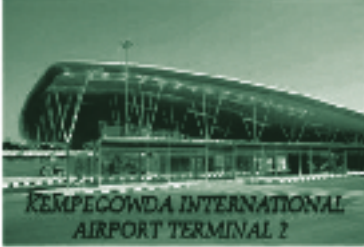
KEMPEGOWDA INTERNATIONAL AIRPORT TERMINAL 2

BOOKINGS OPEN FOR GENERAL PUBLIC FIRST COME FIRST SERVE